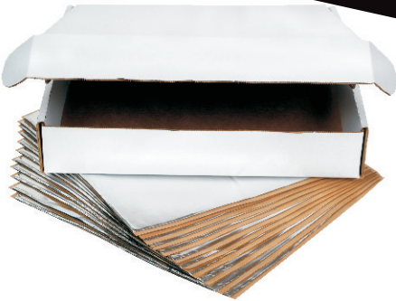
Part No. 80550